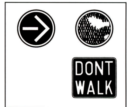
Round and Square Lenses